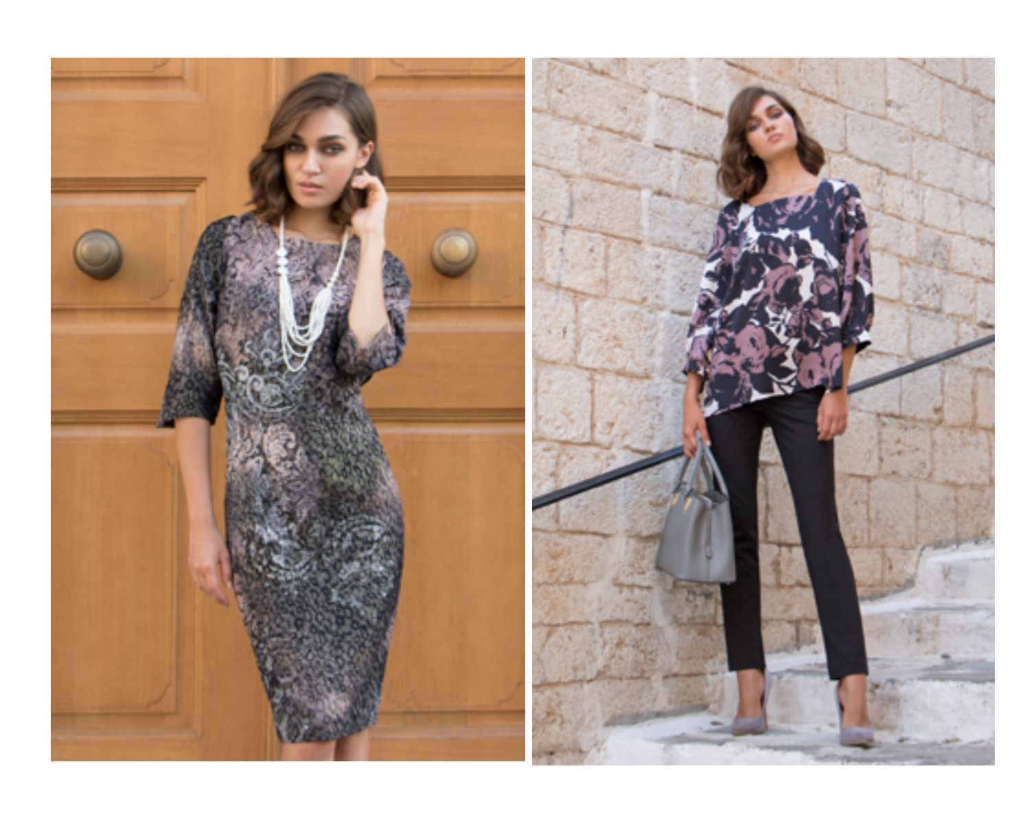
IF I'M GOING TO DRESS UP, I LIKE THINGS THAT ARE QUITE LONG AND CLASSIC. I LIKE FEELING DRESSED UP AND LIKE A LADY.